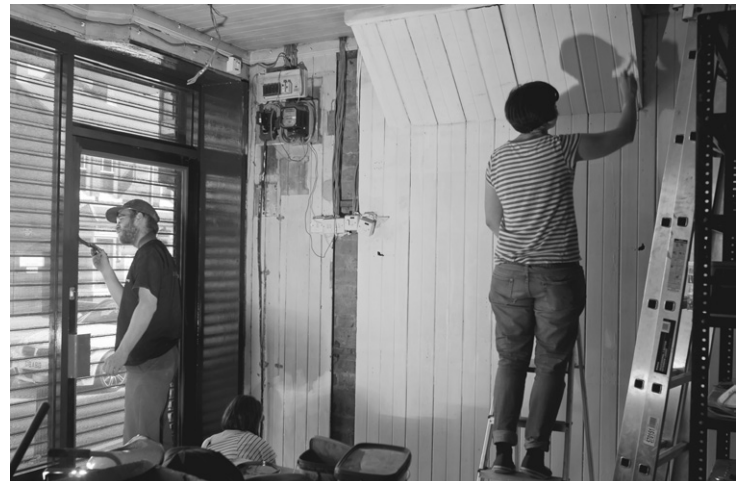
Above and above left: Birmingham Bike Foundry prepare the shop they have just rented for being open to the public.

For more info about the gatherings or the Trading Co-ops Network, contact Footprint Workers' Co-op on: footprint@footprinters.co.uk or 0113 262 4408