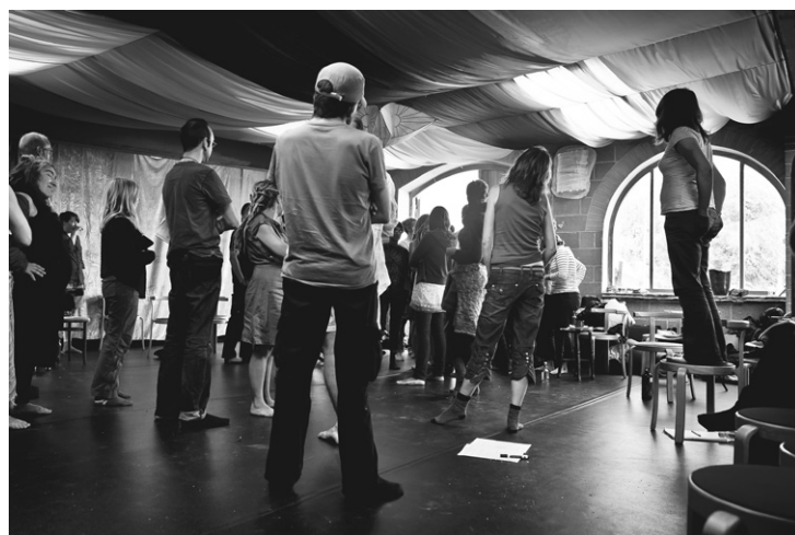
A facilitated political discussion at a gathering. Associate members are able to take part in such exercises.

To become an Associate Member, co-ops must be in common ownership and