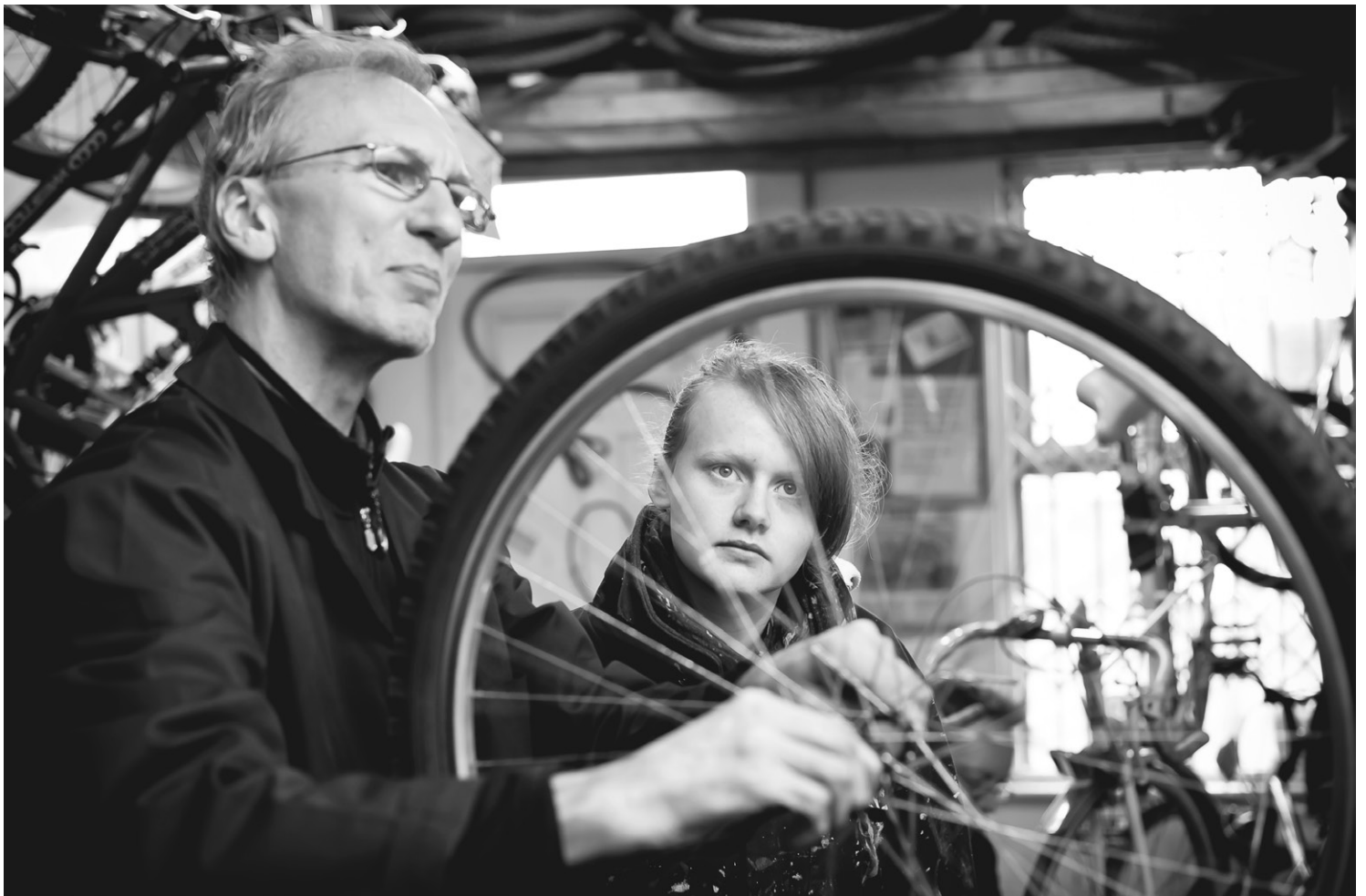
Training at the Peace House's Coventry Cycling Centre.