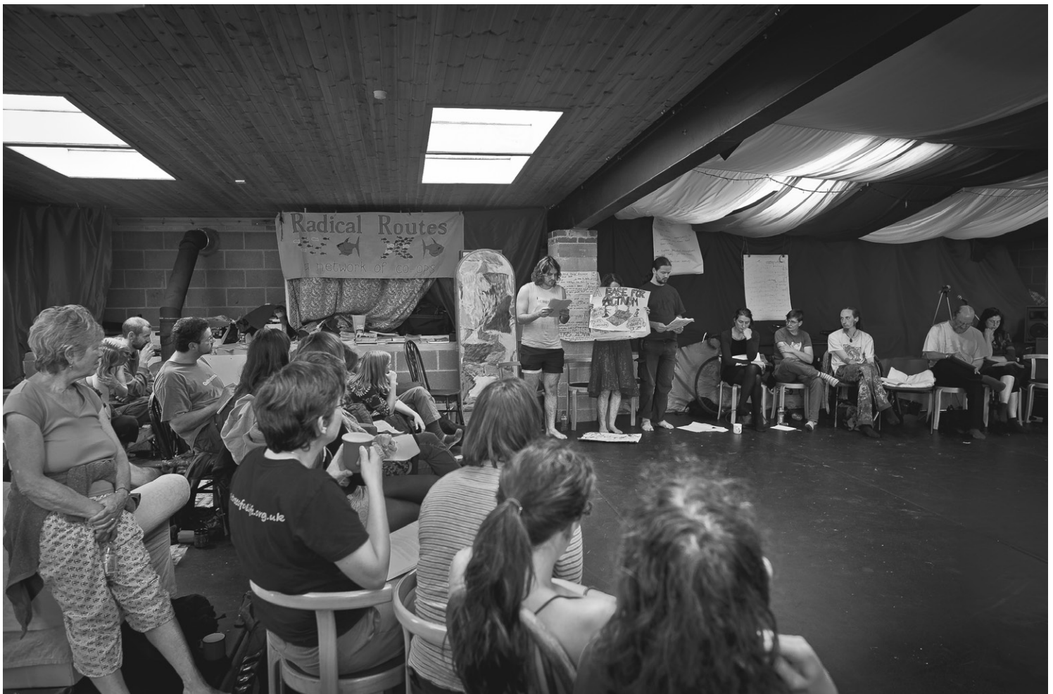
A prospective member co-op presents to the gathering.

Although you have to be a registered co-op to join Radical Routes, lots of people come to a gathering to find out how to register and meet people with similar aims. Get in touch to find out when and where the next gathering is taking place if you're thinking of coming along.