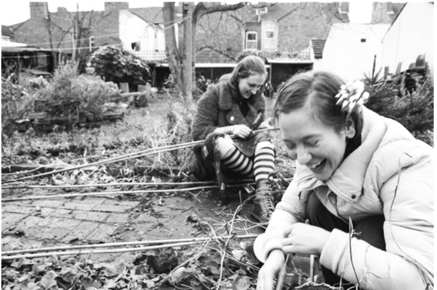
A working weekend at the Peace House and [overleaf] some of the bikes from the recycling project.