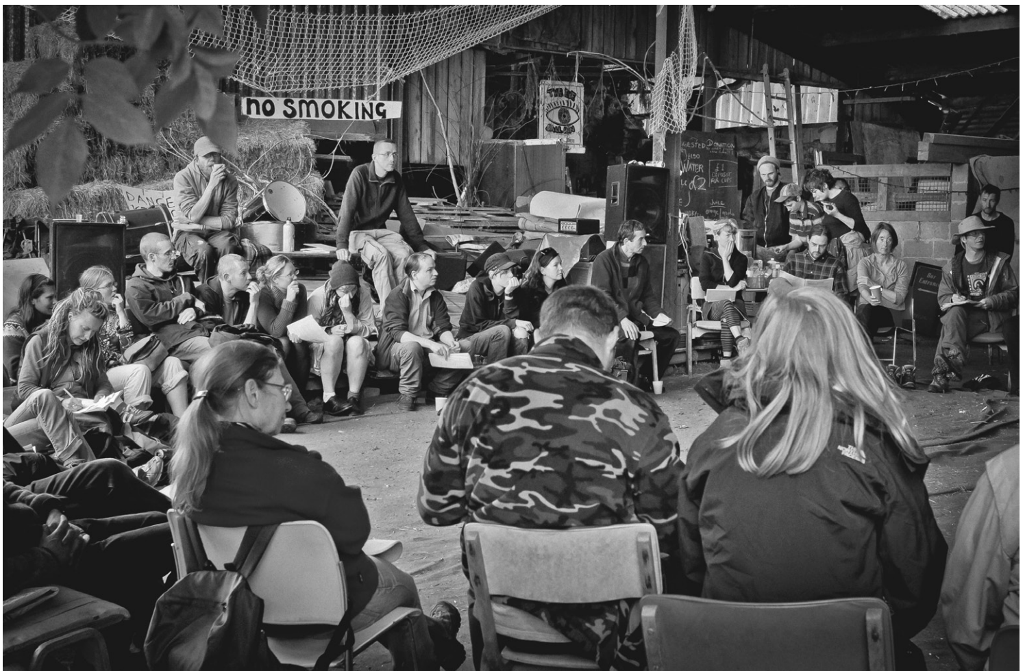
A business meeting at a RR summer gathering.

To get a loan member co-operatives must produce evidence that they can repay the loan. A business plan is required detailing, amongst other things, how the repayments will be made. Applications