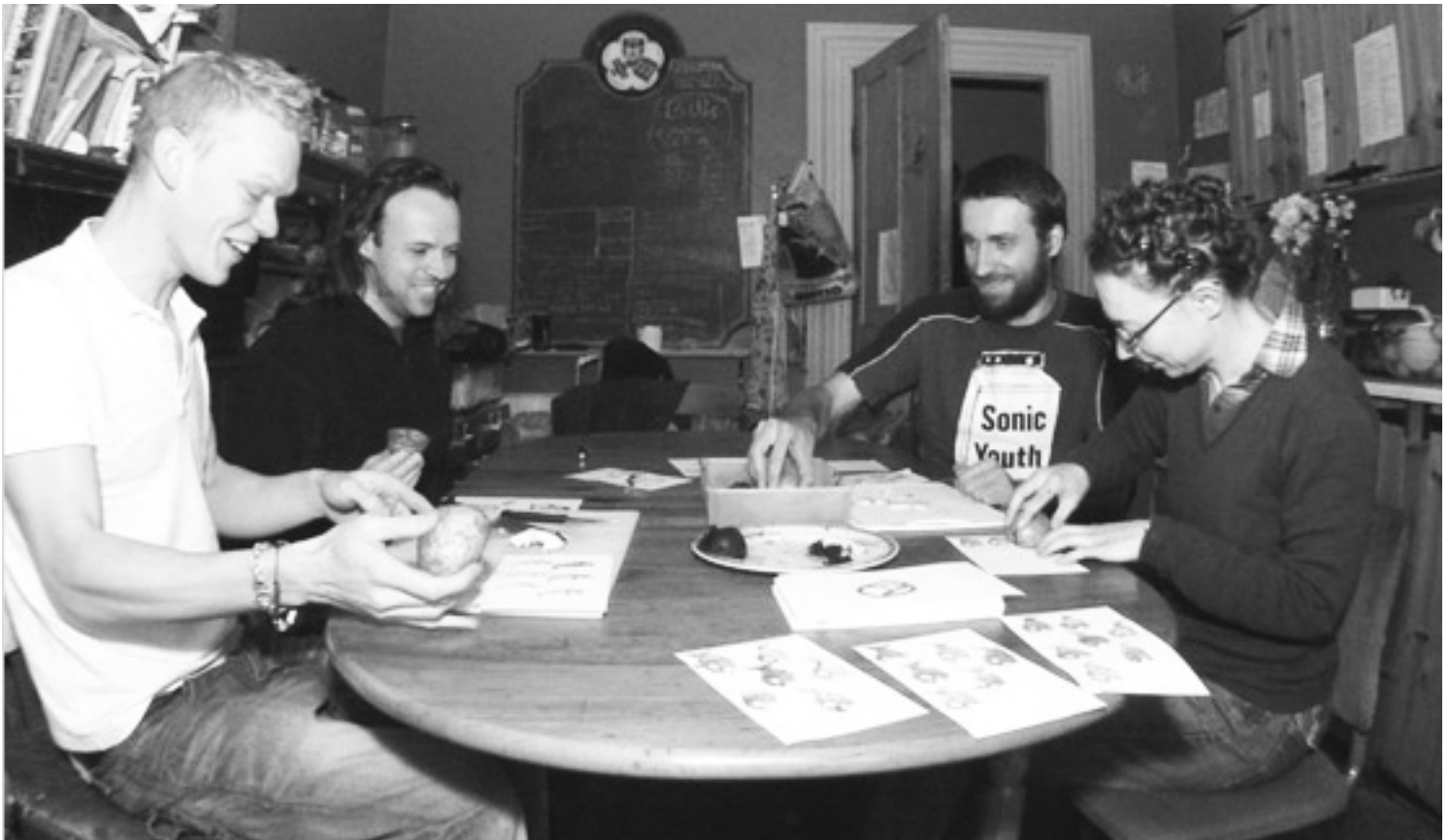
Footprint workers' co-op.

We pay ourselves a decent hourly rate, but don't work many hours, which means we limit our income in line with the Radical Routes ethic of low consumption. However, it does give us leeway either to work more